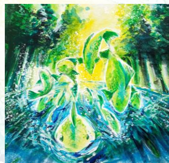
"Kappatuwrei" (Lively and flexible) by WA(2021)

At the Asian Society of Human Services, We set up a place to learn regardless of the presence or absence of obstacles, and define equal and comprehensive education to be done there as Inclusive Education.